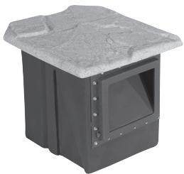
DIY POND SKIMMER 90

VIEW OTHER GREAT BLUE THUMB PRODUCTS ON-LINE AT SHOPBLUETHUMB.COM