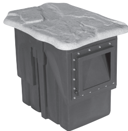
DIY POND SKIMMER 180