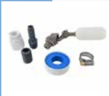
Auto Fill Kit #ABDAUTO