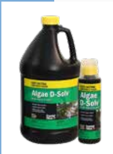
Algae D-Solv® #PB2002