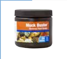
Muck Buster® #PB2682