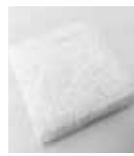
Acrylic-safe Algae Scrub Pad