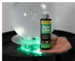
Algae D-Solv® #PB2002