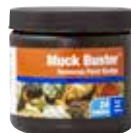
Muck Buster® #PB2682