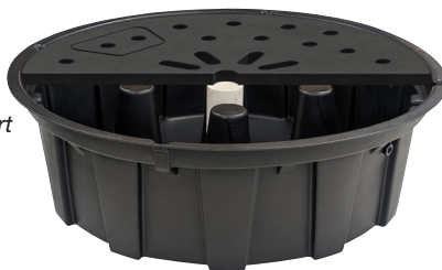
Interior view of molded basin with added PVC Center Support (shown in white)